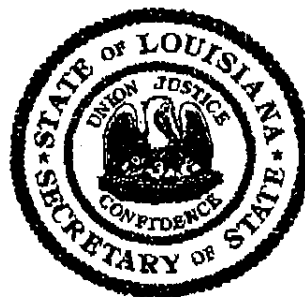
Secretary of State 34573318D