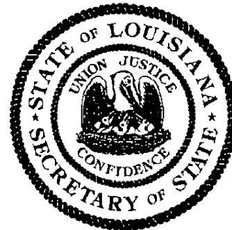
Secretary of State 34318773D