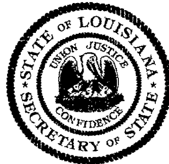
Secretary of State 34395286N

In testimony whereof, I have hereunto set My hand and caused the Seal of my Office To be affixed at the City of Baton Rouge on, October 1, 2007