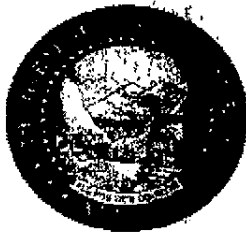
DEAN HELLER Secretary of State

Electronic Certificate Certificate Number: C20061201-0082 You may verify this electronic certificate online at http://secretaryofstate.biz/