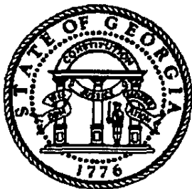
Karen C Handel Secretary of State

WITNESS my hand and official seal in the City of Atlanta and the State of Georgia on September 9, 2008