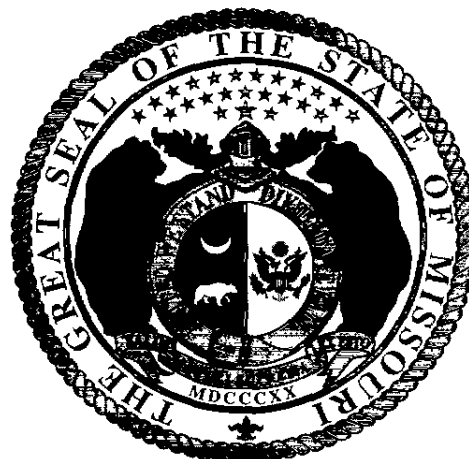
Secretary of State

Certification Number: 8282304-1 Reference: Verify this certificate online at http://www.sos.mo.gov/businessentity/verification