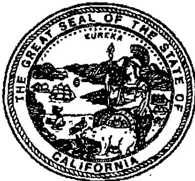
BRUCE McPHERSON Secretary of State

IN WITNESS WHEREOF, I execute this certificate and affix the Great Seal of the State of California this day of May 19, 2005.