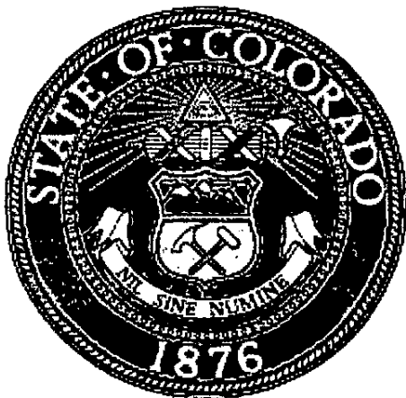
Secretary of State of the State of Colorado

I have affixed hereto the Great Seal of the State of Colorado and duly generated, executed, authenticated, issued, delivered and communicated this official certificate at Denver, Colorado on 03/05/2015 @ 08:38:39 pursuant to and in accordance with applicable law. This certificate is assigned Confirmation Number 9114811.