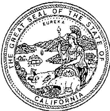
ALEX PADILLA Secretary of State

IN WITNESS WHEREOF , I execute this certificate and affix the Great Seal of the State of California this day of December 27, 2019.