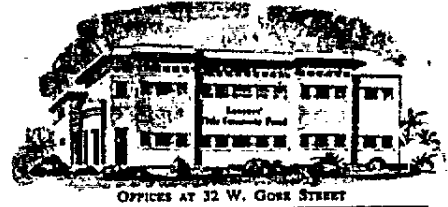
OFFICES AT 32 W. GORE STREET

MAIL ADDRESS • P. O. Box 2671 • ORLANDO, FLORIDA 32802 TELEPHONE (305) 241-4671